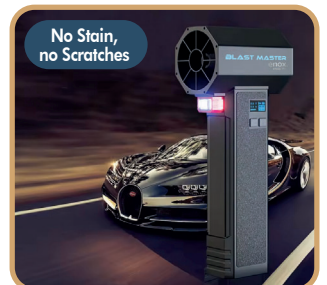
No Stain, no Scratches

We reserve ourselves the Right to change Specifications and Design without Prior Notice. Manufactured in China according to the high German Quality Standards of ENOX, Hamburg/Germany