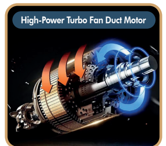
High-Power Turbo Fan Duct Motor