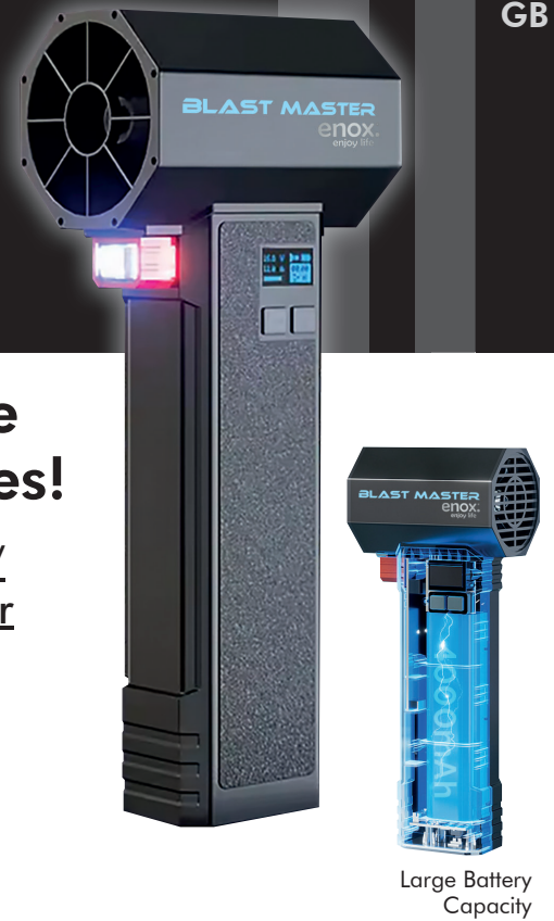
Large Battery Capacity

A Must for Car, Home, Garden – You will love it!