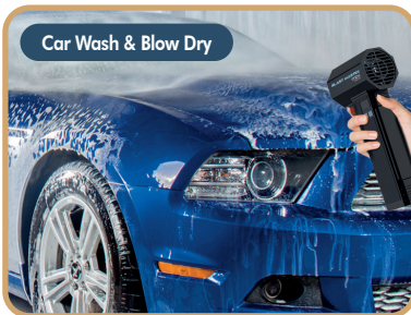
Car Wash & Blow Dry